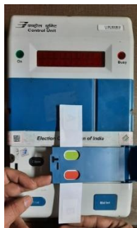
Fixing Green Paper Seal