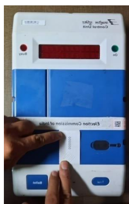
Affixing Green Paper Seal