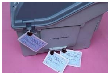
Sealing of Drop Box of VVPAT with Address Tag