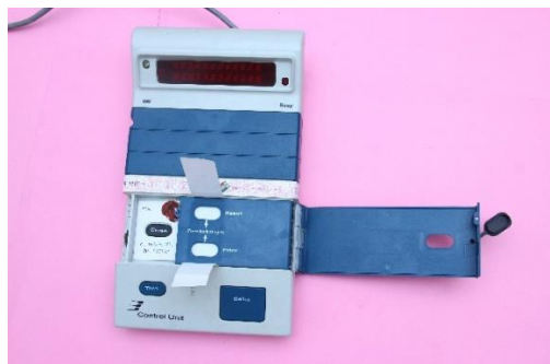
Sealing inner Result Section with Special Tag